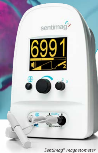
Sentimag ® magnetometer