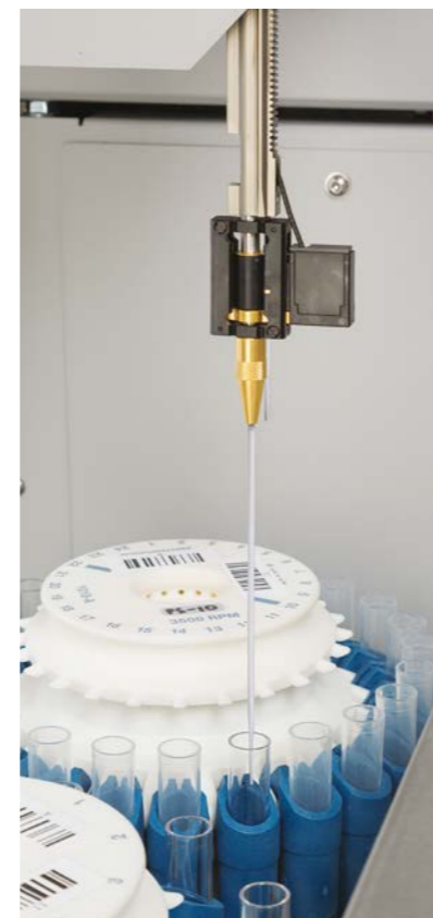
Dual pipetting probes for fast throughput