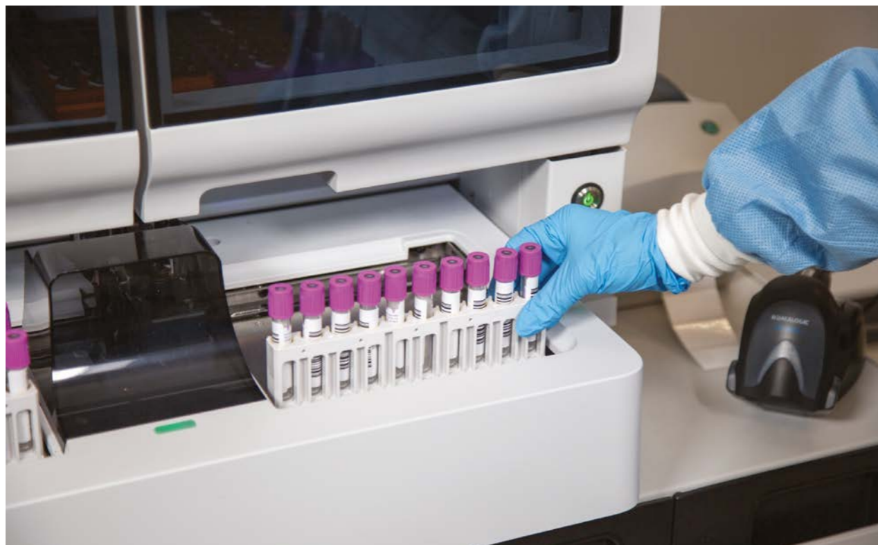
Loading the autosampler