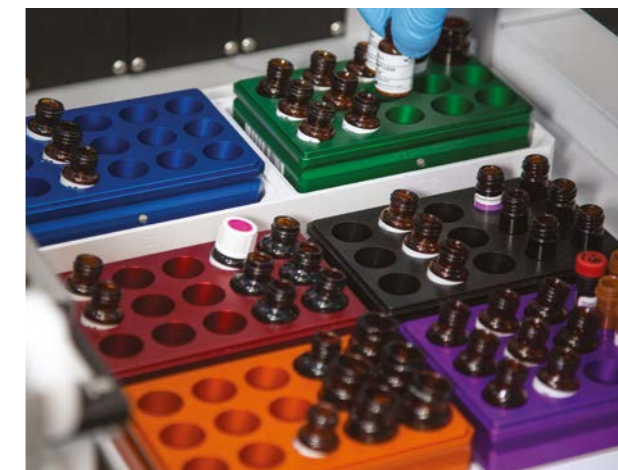
PS-10 reagent blocks hold up to 90 antibody reagent vials of different sizes