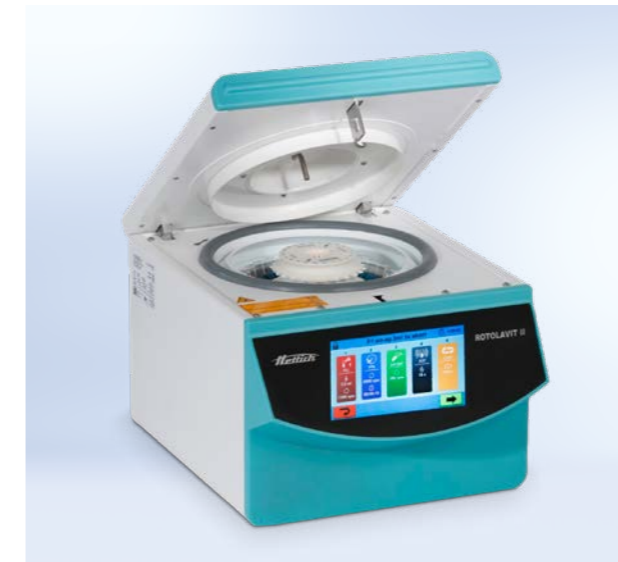
Hettich Rotolavit II-S automated cell washing system